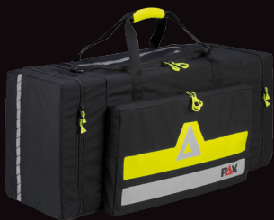
PAX Firefighter Kit Bag