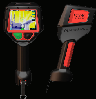
Seek Thermal AttackPRO NFPA