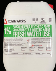
Phos-Chek 1% FF Class A/B