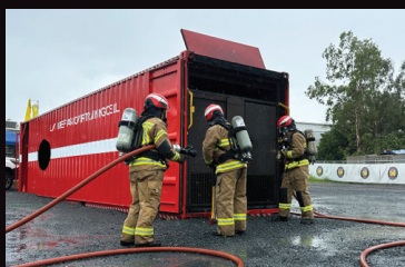
Gasworks Live Fire Devices