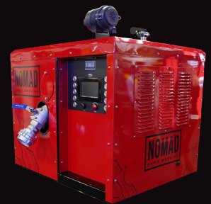
Nomad P5Xd Single Stage Diesel Fire Pump Module