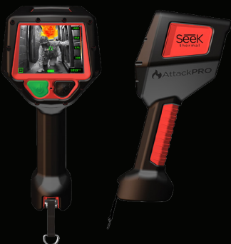
Seek Thermal AttackPRO