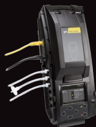
Honeywell IntellidoX Docking Station