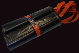
Bridgehill Car Standard