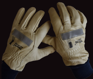
Firepro Wildfire Level 1