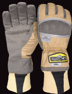
ESKA Ares Structural