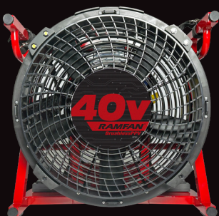
EX50Li DeWalt Milwaukee Makita