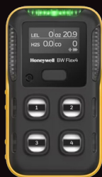
Honeywell BW Flex4