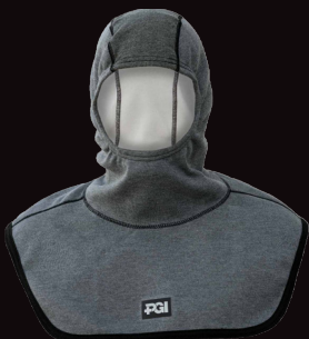
PGI BarriAire Silver