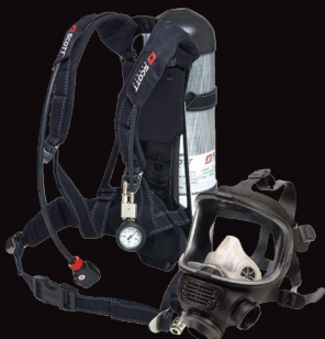
Scott Safety ProPak