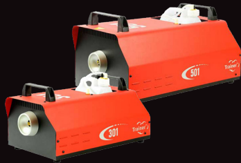
Trainer Smoke Machines