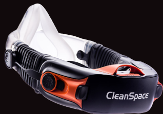
CleanSpace Ultra Half-Face Mask