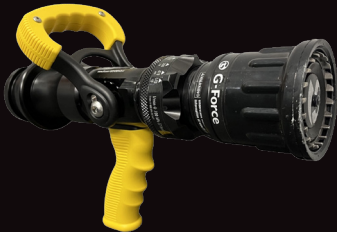
TFT G Force