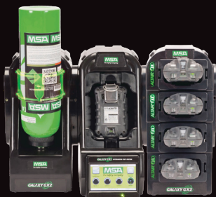
MSA Galaxy GX2 Test Station