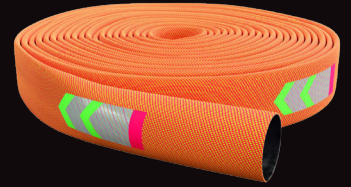
OSW Fire Safety