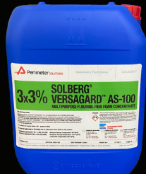
Solberg Versagard Class B