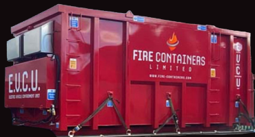
Electric Vehicle Containment Unit (E.V.C.U.)