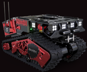
Shark Robotics Colossus