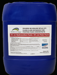
Solberg Re-Healing Class B