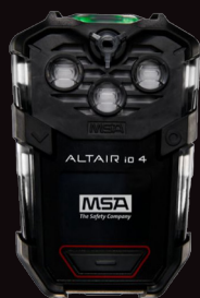
MSA Altair io4