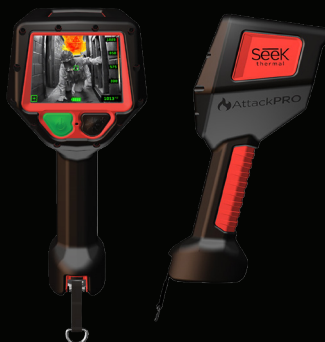
Seek Thermal AttackPRO VRS