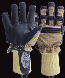
Askto Fire Keeper