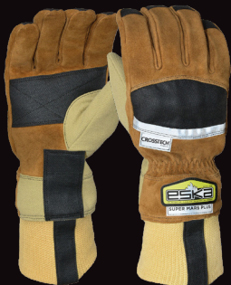
ESKA Supermars Plus Structural