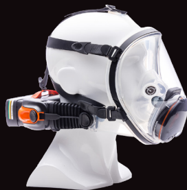
CleanSpace Ultra Full-Face Mask