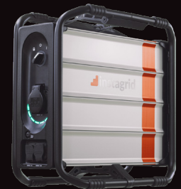
Instagrid ONE MAX