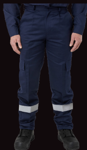
Stewart & Heaton T243 Wildand Trousers