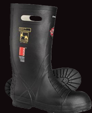
Skellerup Fire Fighter Extreme