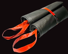
Bridgehill Car Pro X