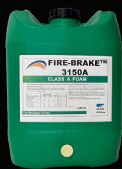
Solberg Fire-Brake Class A