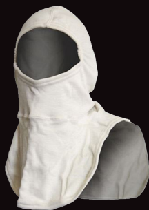
Stewart & Heaton Nomex Blend